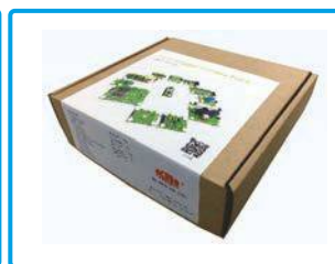
faya-nugget Combo Pack